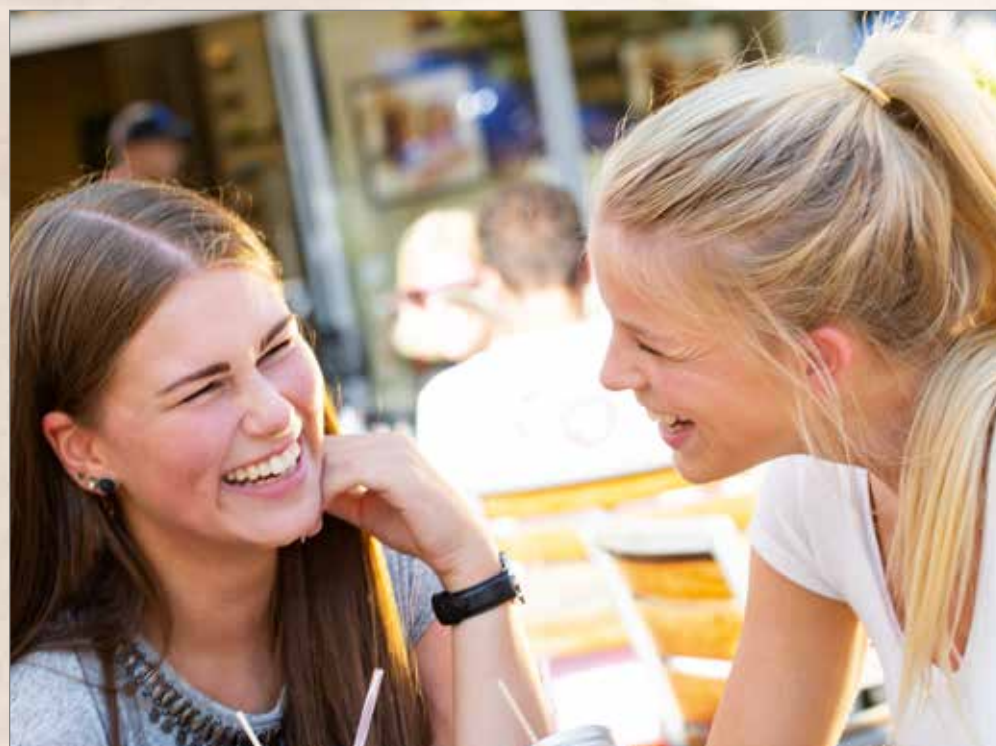
The Office for Fair Weather Clouds advises: „In extreme sunshine, you should grasp at straws!“

pineapple, apple, cranberry, blackcurrant, cherry, lemon squash, passionfruit or rhubarb spritzer 0,2 l 0,5 l